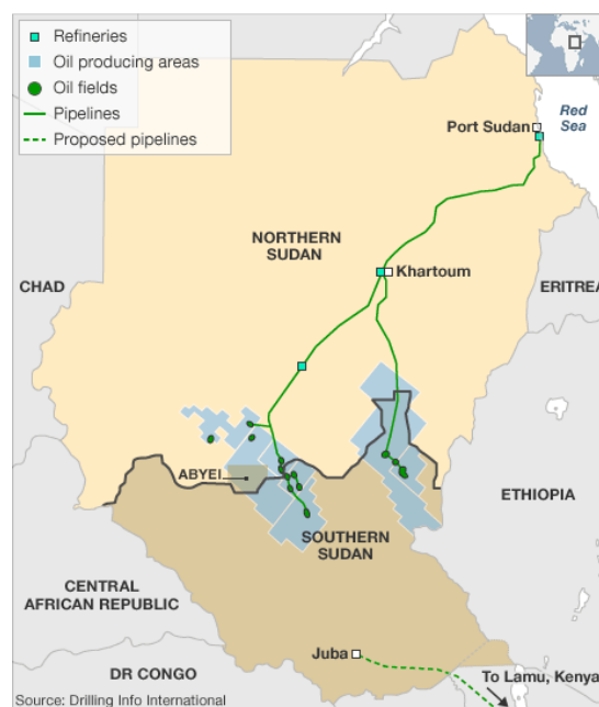
3. Figure. Sudan & South Sudan oil infrastructure, 2006

The peace and separation in 2011 was a historical opportunity for the two new countries to solve their differences.