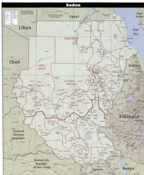
2. Figure. Political map of the old Sudan

Also, they had economic and geographical inequalities, furthermore, as it will be highlighted in the current article many times, they had different amount and division of resources. To unveil the economic importance of the two investigated countries it is necessary to go through its history, geographical endowments and its surrounding region, the Nile River Basin.